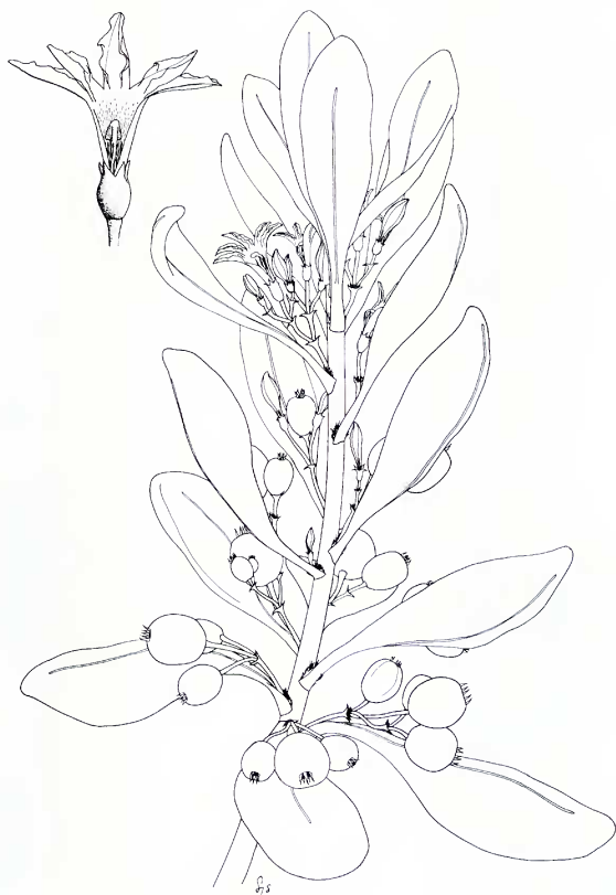
Figure 2. Scaevola sericea : flowering-fruiting branch, \times 1 ; upper left, flower, adaxial view, \times 2 .